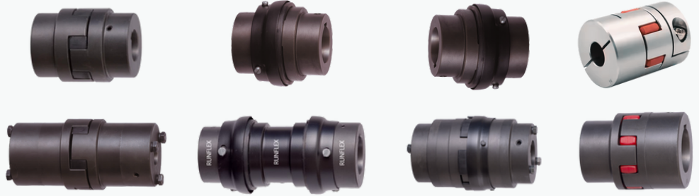
RFL / RFRL