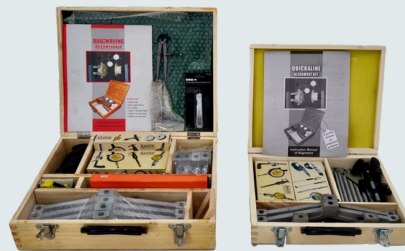
QUICKALINE ALIGNMENT KIT